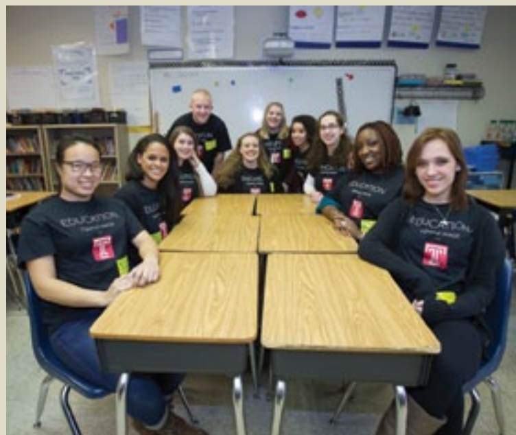
Members of the SLPC and College of Education volunteers at Greenfield Elementary in downtown Philadelphia after conducting lessons about the life of Martin Luther King, Jr. for the 4th-grade classes

So far this year the SLPC has organized events celebrating American Education Week to thank present teachers, participated in a service project for Martin Luther King Jr. Day, hosted a table during the Temple Toast on February 17 and collected notes for donors during Thank A Donor Week.