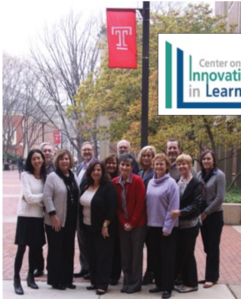
The CIL staff members gathered together recently for a staff retreat.