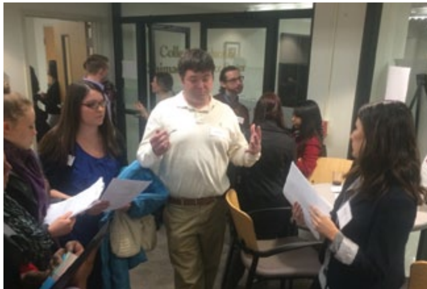
Student teachers networked with regional employers during the "Owls of a Feather Network Together" event on Monday, Feb. 16, in the Shimada Resource Center.